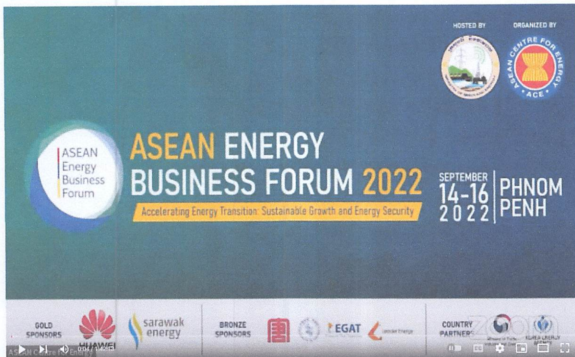
ASEAN Energy Awards 2022 - Awarding Ceremony